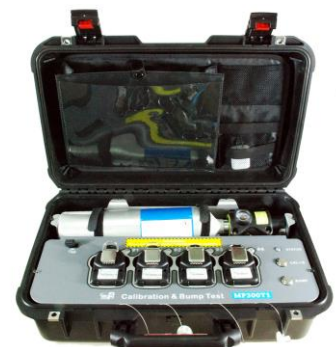
CaliCase Docking Station