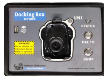
UNI Docking Box