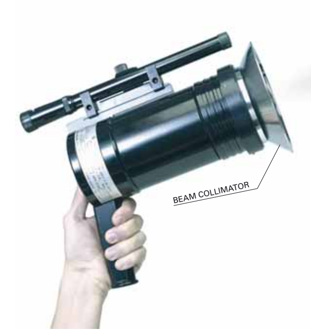
The drawing is for demonstration only

Avoids the cost of scaffolding or supports to access the detector – able to test at distances up to 29ft (9m) from the detector location!