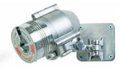
SPECTREX 40/40I TRIPLE IR FLAME DETECTOR

The Spectrex Flame Simulator is the only safe method to test the flame detector's sensors, internal electronics, alarm activation software, cleanliness of the viewing window/lens, wiring integrity, actual relay activation, and