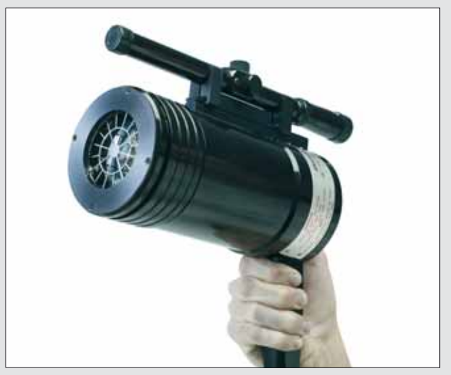
Without Beam Collimator

The specially designed Beam Collimator attachment (part no. 20/20-190) can be used to extend the simulator's testing distance, thus facilitating easier testing and encouraging the testing to be carried out – all without the need for costly access equipment.