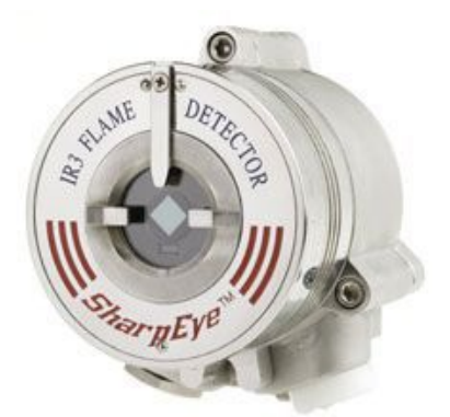
40/40I Triple IR Flame Detector