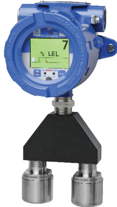
Aluminum "AL" XP model with Dual Sensor

The State-of-the-art SenSmart 6000 gas detector is built with our proven 'ST-44' transmitter. This versatile unit has a bright, vivid color display and embedded Ethernet with Webserver and Modbus TCP. The high performance, universal gas detector supports dual smart sensors with different type like Electrochemical, Catalytic Bead, Infrared and Photoionization sensors.