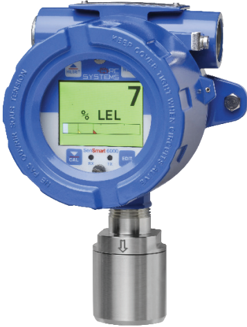
Aluminum "AL" XP model

"The Art of Gas Detection" - Built with our Proven ST-44 Transmitter