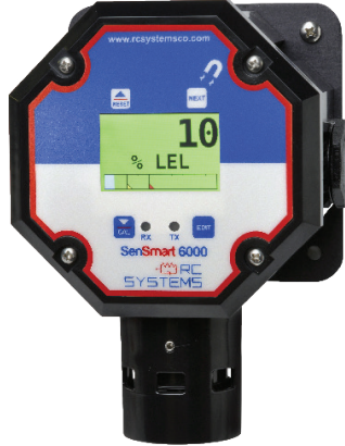
Non-metallic Poly "PY" model