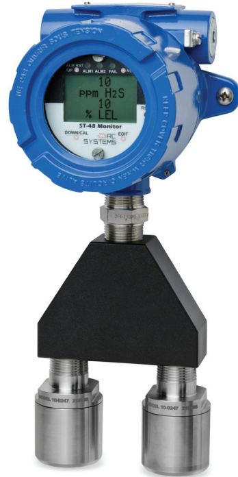
Aluminum "AL" XP model with Dual Sensor

The SenSmart 3000 3-wire gas detector is built with our reliable 'ST-48' smart transmitter, which provides the cutting-edge technology in toxic and combustible gas detection. It's a universal, easy to use detector that supports dual smart sensor with different types, including electrochemical, Catalytic Bead, Infrared and Photoionization sensors.