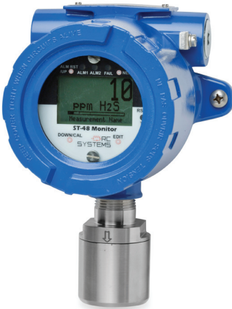
Aluminum "AL" XP model

"The Art of Gas Detection" - Built with our Proven ST-48 Transmitter