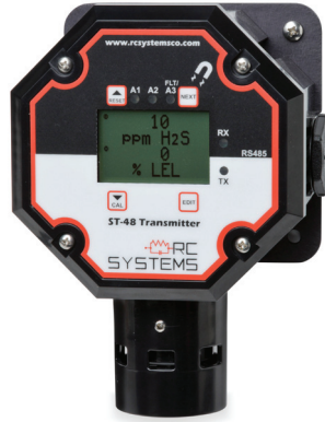
Non-metallic Poly "PY" Div 2 model