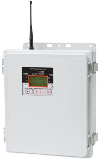
ST-90PYQUAD NEMA 4X Non-Metallic 90-50

The ST-90 Quad Channel Controller provides simultaneous display and alarm functions for four monitored variables. Easy to configure and user friendly, the ST-90 Quad can function as a critical alarm controller for toxic gases, combustible gases, vibration, tank levels and other process values.