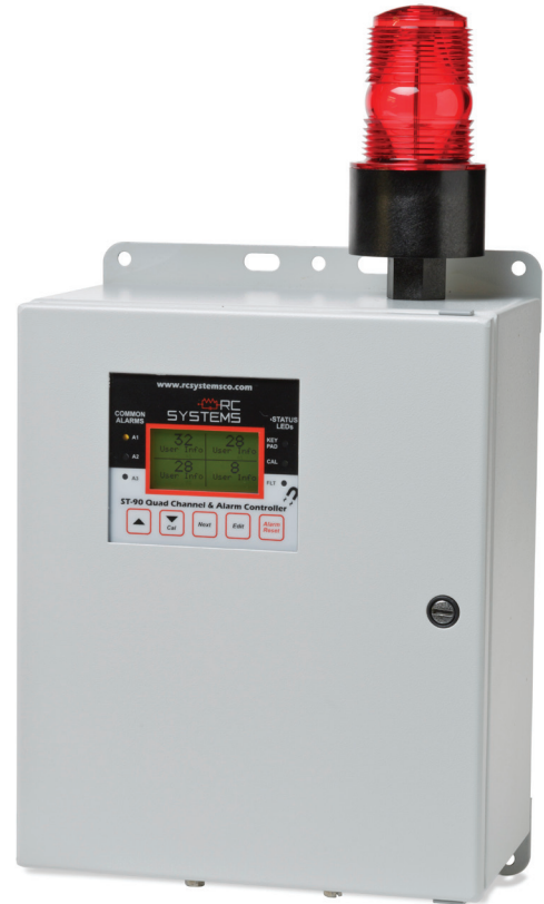
ST-90PCSQUAD Painted Carbon Steel 90-51

The ST-90 Quad Channel Controller provides simultaneous display and alarm functions for four monitored variables. Easy to configure and user friendly, the ST-90 Quad can function as a critical alarm controller for toxic gases, combustible gases, vibration, tank levels and other process values.