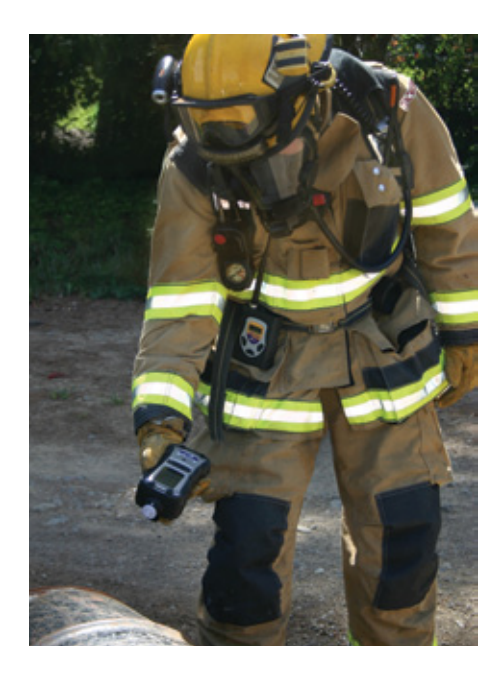
MultiRAE Pro with RAELink3 Mesh used for screening potentially hazardous drums