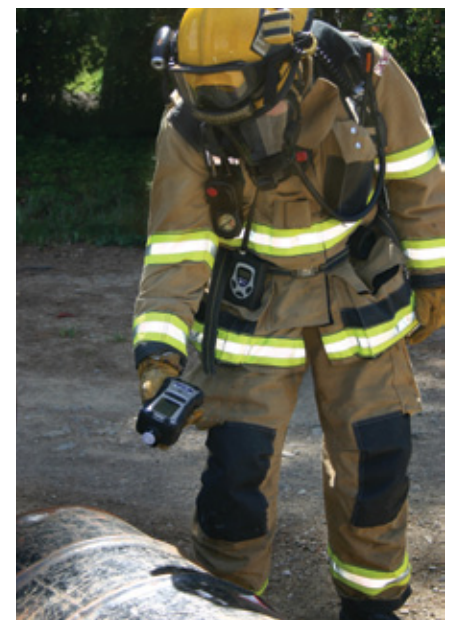
MultiRAE Pro with RAELink3 used for screening potentially hazardous drums