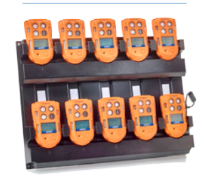
10 way charger For charging and storing your MG-1 fleet