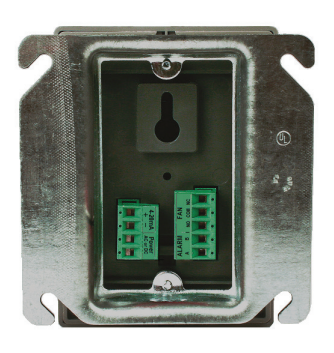
CD-6H Rear View