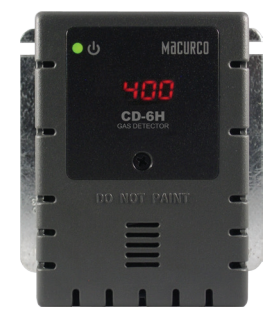
Optional housing and label