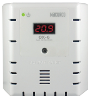
White Housing Option