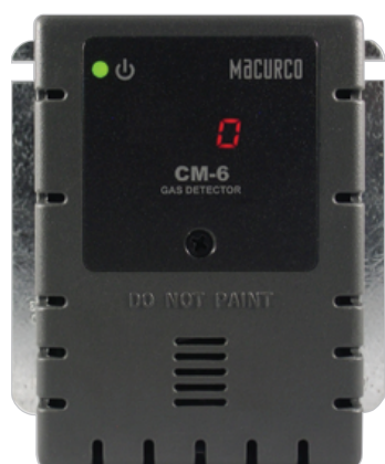
Grey Housing (Standard)

The Macurco 6 & 12 Series fixed gas detectors provide life-saving solutions to protect people and property. These fixed gas detectors are designed for low-level detection, mitigation, and notification. Let these detectors do the work for you by shutting off valves, turning on fans, engaging horns and strobes, and providing notification to fire panels and building automation systems when gases reach vital limits.