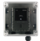
Weatherproof Housing Kit (Detector sold separately)