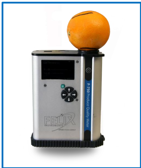
Figure 1. F-750 in the process of measuring oranges.

High levels of Total Soluble Solids are positively correlated with consumer preference in citrus, and therefore harvest time should be managed to maximize Total Soluble Solids. Historically, Total Soluble Solids, or “Brix”, have been destructively measured using a refractometer. Near Infrared (NIR) technology, utilized by the F-750 Produce Quality Meter, can assess Total Soluble Solid content non-destructively. To determine the effectiveness and viability of the F-750 Produce Quality Meter in measuring Total Soluble Solids in oranges, a study was carried out sampling 64 Mandarin oranges. Applying the methods adapted from the Felix Instruments Mango Standard Operating Procedure, reference values were correlated with the spectral data collected with the F-750. Results show that the F-750 Produce Quality Meter precisely and non-destructively measures Total Soluble Solids in oranges, with a calculated root mean square error of cross validation of 0.84 Total Soluble Solids.