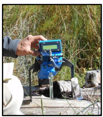
FROG-4000<sup>™</sup> GC System.