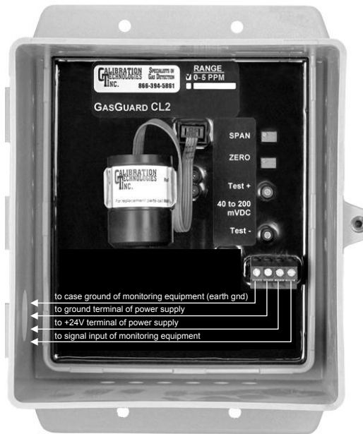
Figure 2: Wiring diagram