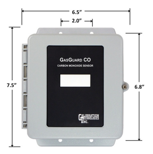
Figure 1: Mounting dimensions