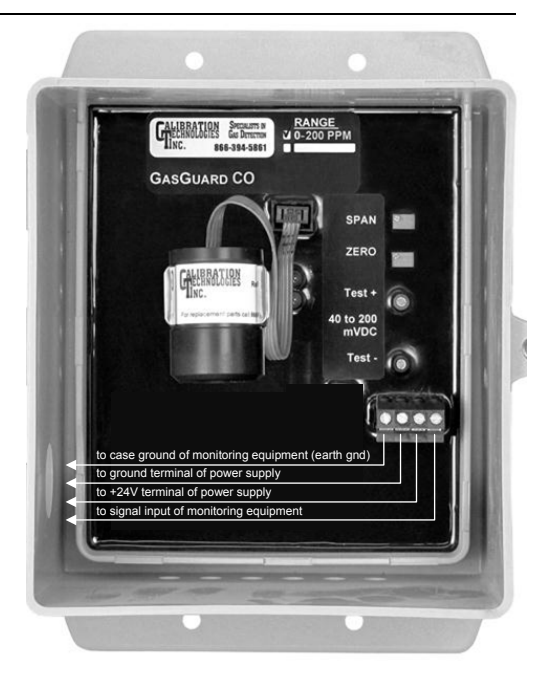
Figure 2: Wiring diagram