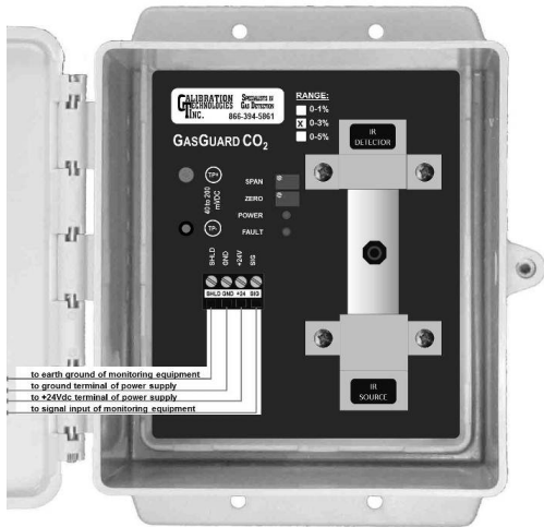
Figure 2: Wiring diagram