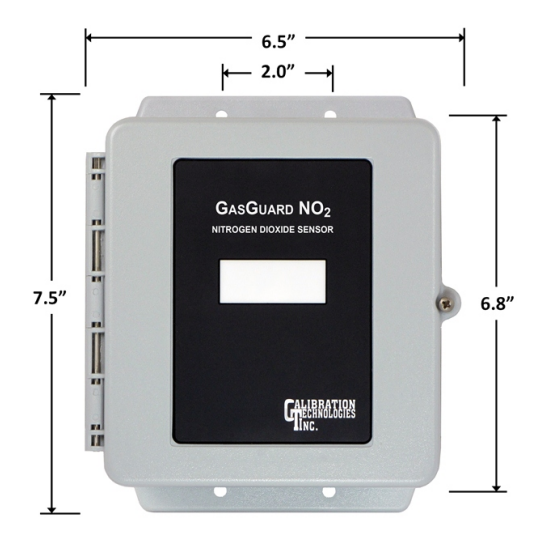
Figure 1: Mounting dimensions