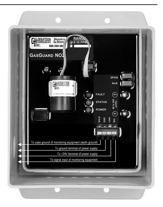
Figure 2: Wiring diagram