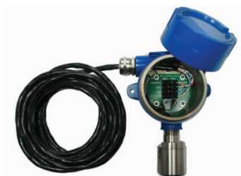
Shown with 10-0247 stainless steel sensor head

The 10-0411 Remote Sensor Kit allows smart sensors to be mounted up to 15 feet away from the SenSmart 7000 . SenSmart 7000 s may be configured as single or dual sensor monitors so either one or two 10-0411 Remote Sensor kits may be connected to each SenSmart 7000 . When combined with the 10-0247 Stainless Steel sensor head, the 10-0411 is suitable for Division 1 hazardous locations.