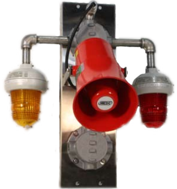
GDS-450X 2 - 1 / 1 / 1 - 1 - 0 Dual Strobe + Horn Configuration

The GDS-450X Alarm Station also includes a standard external wiring junction box that supports up to three 3/4" NPT conduit entries and provides easy field wiring termination. A 'quick-connect' option is also available that includes pre-wired male connectors in