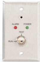
Fireray® 50RU/100RU Accessories