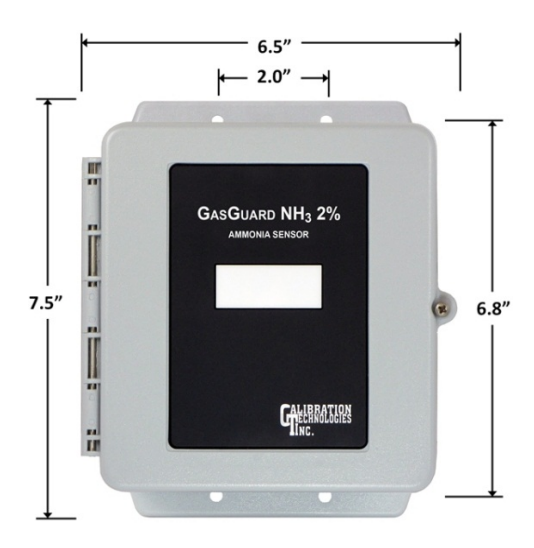
Figure 1: Mounting dimensions