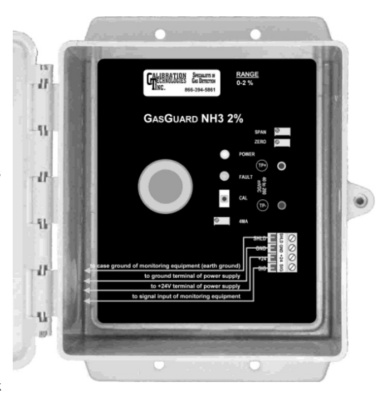
Figure 2: Wiring diagram