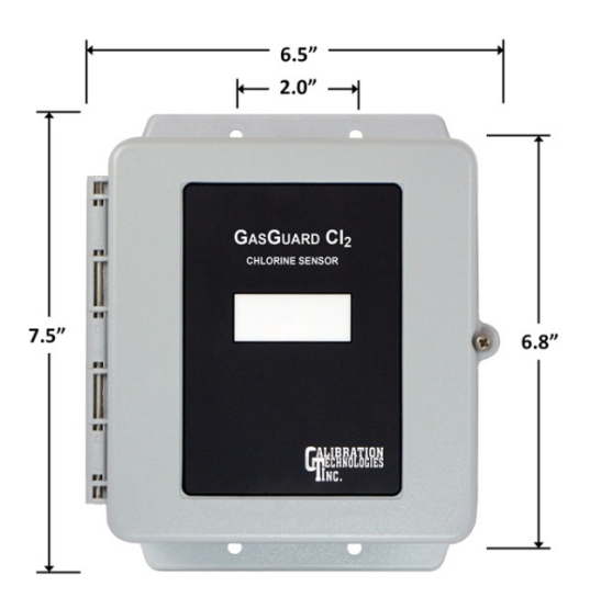
Figure 1: Mounting dimensions