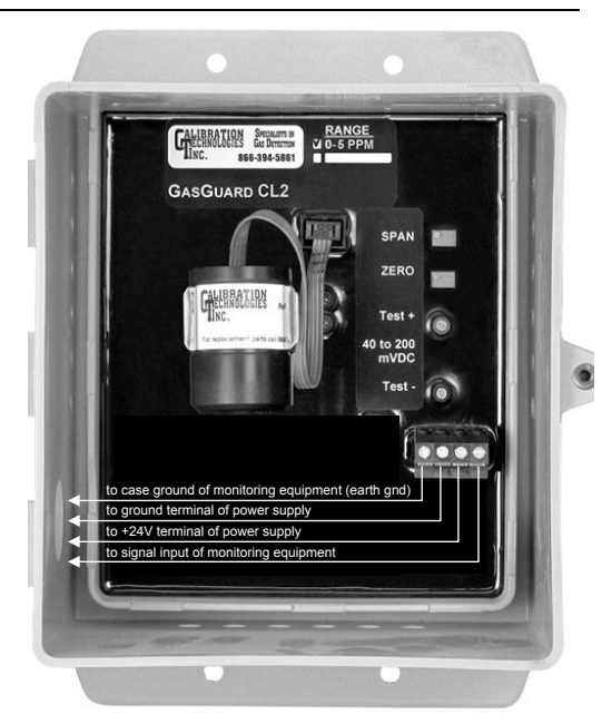
Figure 2: Wiring diagram