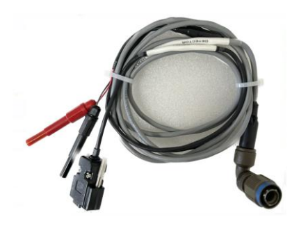
Figure 2 - Universal connection harness for Modbus® / HART® communication (888820)

888815 and 888816 are now obsolete and have been replaced by 888820.