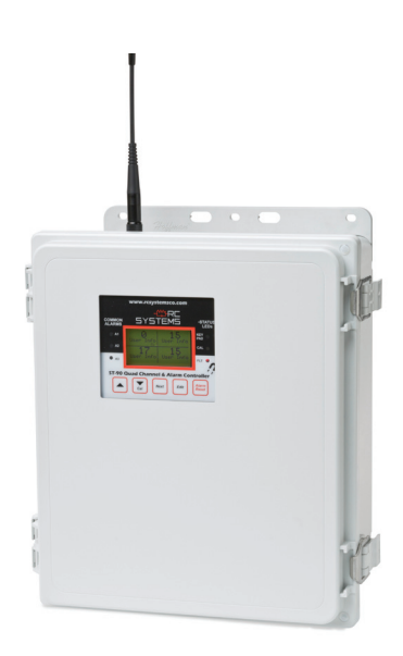
ST-90PYQUAD NEMA 4X Non-Metallic 90-50

The ST-90 Quad Channel Controller provides simultaneous display and alarm functions for four monitored variables. Easy to configure and user friendly, the ST-90 Quad can function as a critical alarm controller for toxic gases, combustible gases, vibration, tank levels and other process values.