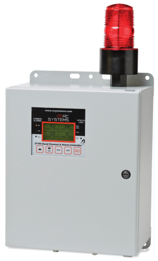
ST-90PCSQUAD Painted Carbon Steel 90-51

The ST-90 Quad Channel Controller provides simultaneous display and alarm functions for four monitored variables. Easy to configure and user friendly, the ST-90 Quad can function as a critical alarm controller for toxic gases, combustible gases, vibration, tank levels and other process values.