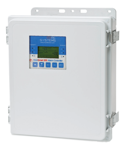
Nema 4X Non- Metallic Enclosure

"The Art of Gas Detection" - Built with our Proven ST-90 Dual Controller