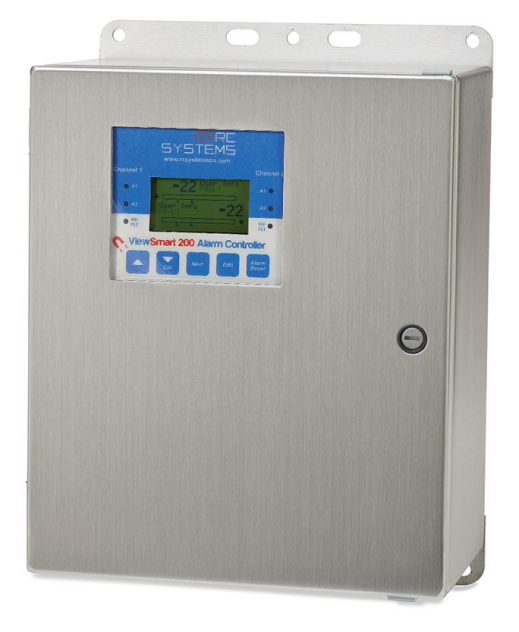
Stainless Steel Enclosure

The ViewSmart 200 2 Channel Controller provides simultaneous display and alarm functions for two monitored variables. Easy to configure and user friendly, the ViewSmart 200 can function as a critical alarm controller for toxic gases, combustible gases, vibration, tank levels and other process values.