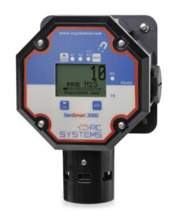
Non-metallic Poly "PY" Div 2 model

The SenSmart 3000 3-wire gas detector is built with our reliable 'ST-48' smart transmitter, which provides the cutting-edge technology in toxic and combustible gas detection. It's a universal, easy to use detector that supports dual smart sensor with different types, including electrochemical, Catalytic Bead, Infrared and Photoionization sensors.