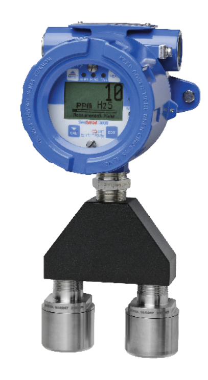
Aluminum "AL" XP model wtih Dual Sensor

The SenSmart 3000 3-wire gas detector is built with our reliable 'ST-48' smart transmitter, which provides the cutting-edge technology in toxic and combustible gas detection. It's a universal, easy to use detector that supports dual smart sensor with different types, including electrochemical, Catalytic Bead, Infrared and Photoionization sensors.