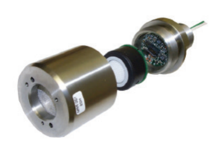
Shown with Aluminum Enclosure

The RC Systems SenSmart 1200 is a 3 wire Gas Detector available in a 316 stainless steel sensor head enclosure and Suitable for Class 1 Division 1 Groups A, B, C, D. These easy-to-install and maintain gas detectors must be connected to an R. C. Systems single or multi-channel receiver to add user calibration and readout functions.