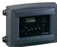
Manning AirAlert™ 96d

Regardless of the number of sensors that need to be monitored, there is a Honeywell Analytics Manning controller system that will suit your needs. These multi-channel stand-alone monitoring/safety systems support up to ten (10) Honeywell Analytics gas detection sensors each and can interface with the plant central safety controls. Modular construction allows easy addition of up to forty (40) extra relay outputs and individual 4/20 mA signal output from each channel.