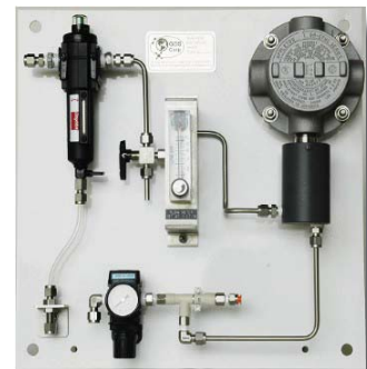
Combustible Gas Monitoring in Automotive Engine Facility