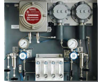
Industrial and Petrochemical Sampling Systems

Fully customized versions of the PSM are available. Please contact GDS Corp for more information.