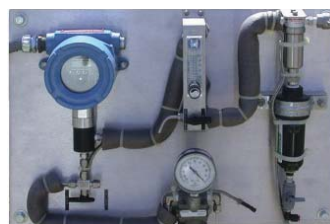
Oxygen Monitoring in Landfill Applications