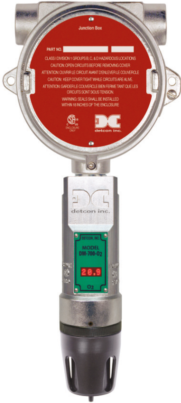
Scrolling Full Message/Text Display