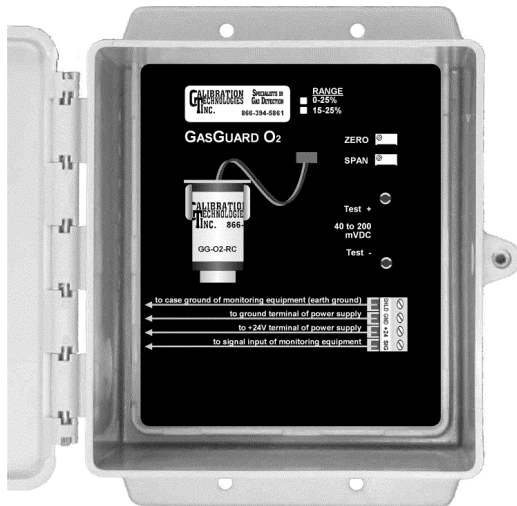
Figure 2: Wiring diagram