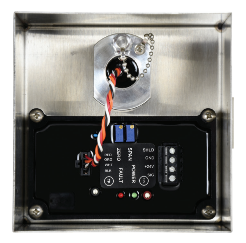
Figure 2: Wiring Diagram